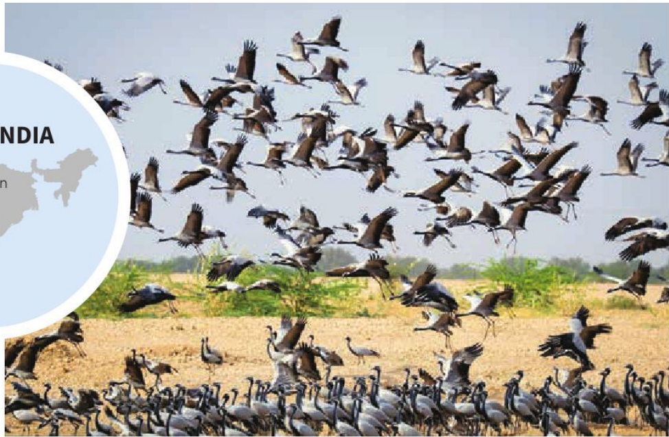
MEDIA SERVICES PHOTOFILE (TRAVELING) SAOENROBERT (GOOD)INGIMAGE®